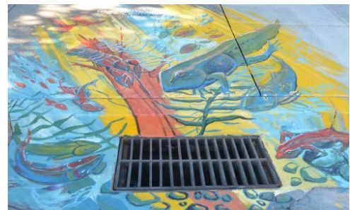
Artist: Jessilyn Brinkerhoff

A committee made up of City staff, Springfield business representatives, and representatives from the art community will select designs from those submitted. The committee will select local artists based on the message being conveyed, how well the art depicts that storm drains lead to rivers untreated, and how well the art encourages the community to help protect local waterways. Art must be tasteful and original and include the storm drain physical components.