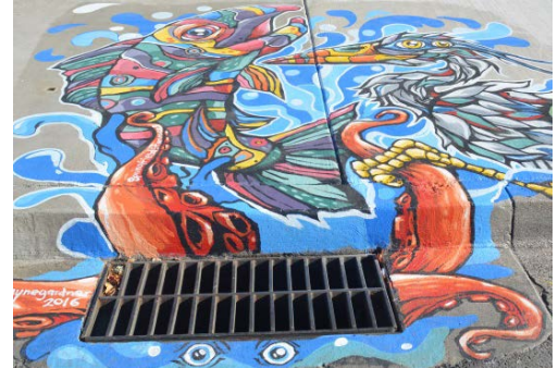
Artist: Bayne Gardner

The City of Springfield is excited for its second annual UpStream Art project to communicate the importance of storm drains, their function, and their connection to our rivers. UpStream Art provides local artists with the opportunity to paint up to five (5) storm drains in downtown Springfield to raise awareness about the importance of protecting our waterways, stream habitat, and aquatic wildlife.