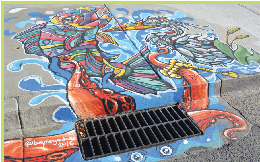
Artist: Bayne Gardner

For the second year, the City of Springfield is seeking local artists to paint murals on up to five storm drains in the downtown area to help raise awareness about the importance of protecting our rivers, stream habitat, and aquatic wildlife.